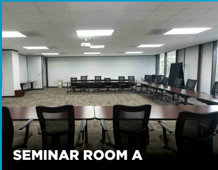
SEMINAR ROOM A