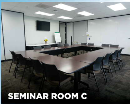
SEMINAR ROOM C