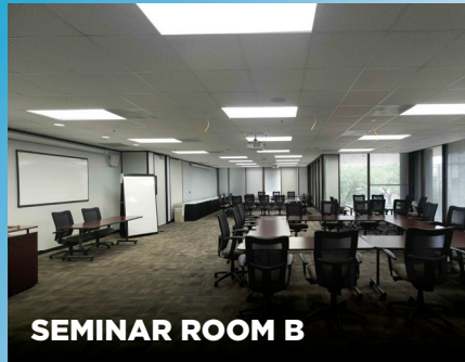
SEMINAR ROOM B