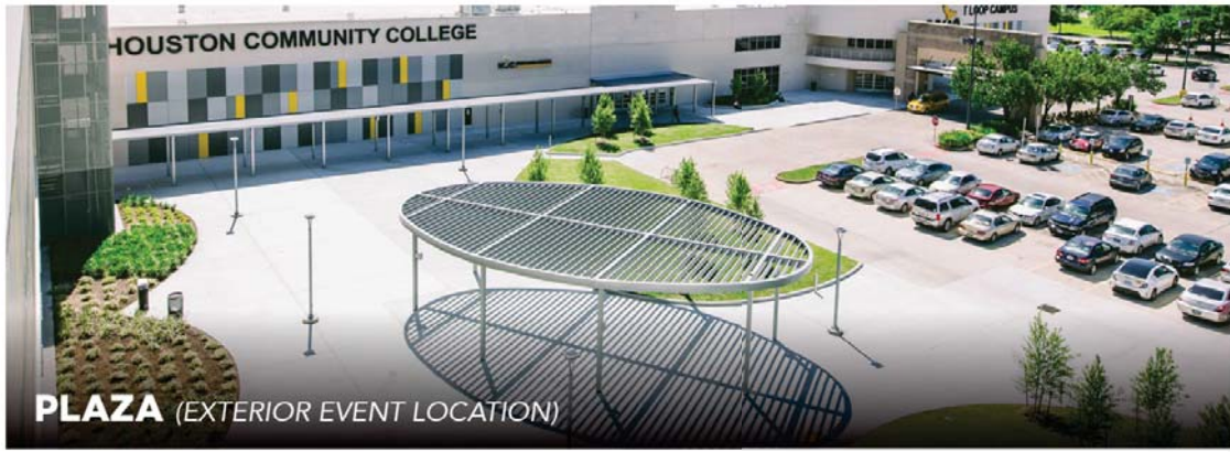
PLAZA (EXTERIOR EVENT LOCATION)