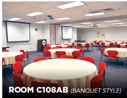
ROOM C108AB (BANQUET STYLE)