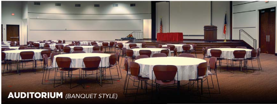
AUDITORIUM (BANQUET STYLE)