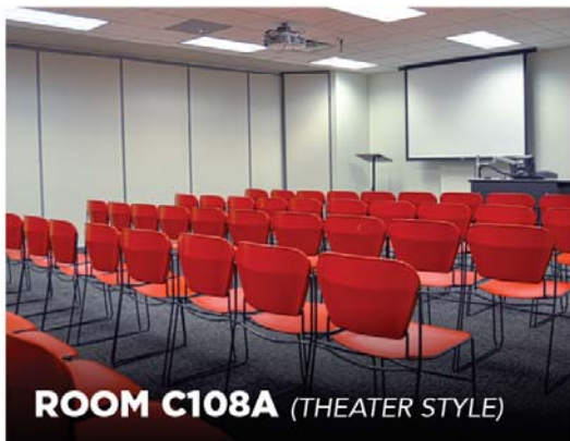
ROOM C108A (THEATER STYLE)