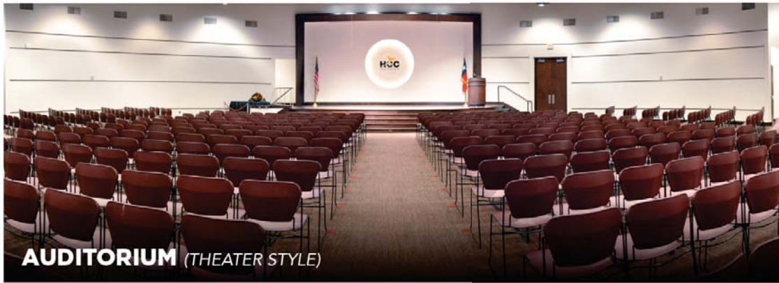
AUDITORIUM (THEATER STYLE)